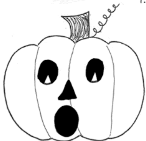
This is Jack O' spooky.