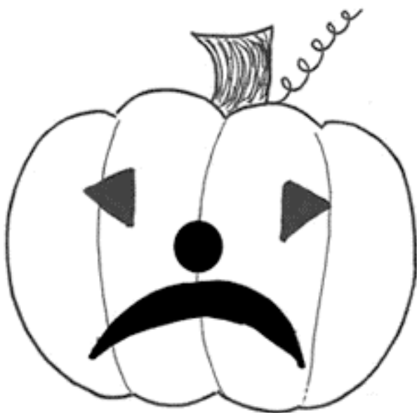
This is Jack O' sad.