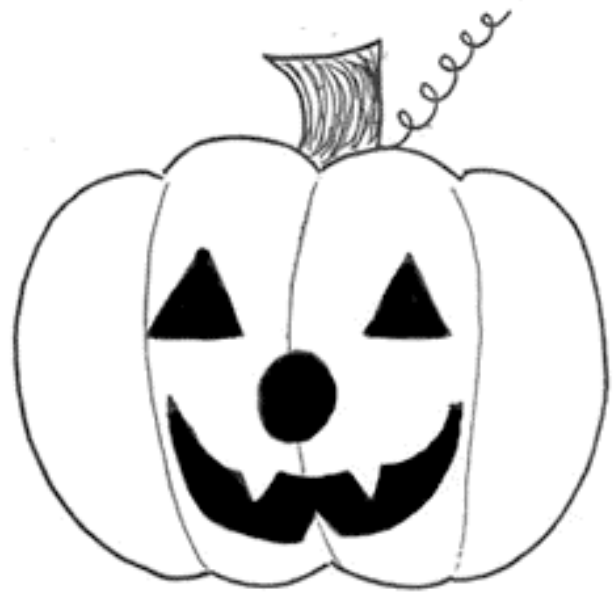
This is Jack O' happy.